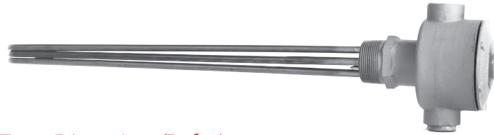
E2 — Dimensions (Inches)